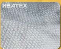
Ceramic Fiber Cloth & Blanket