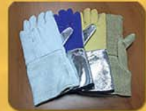
Heat Protection Gloves