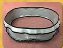
Customised Expansion Joint