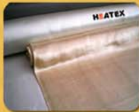
High Temp Fabrics