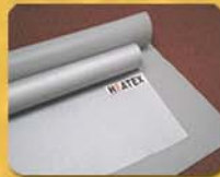
PU & Silicone Fabrics