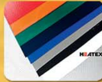
Fire Retardant PVC Tarpaulin